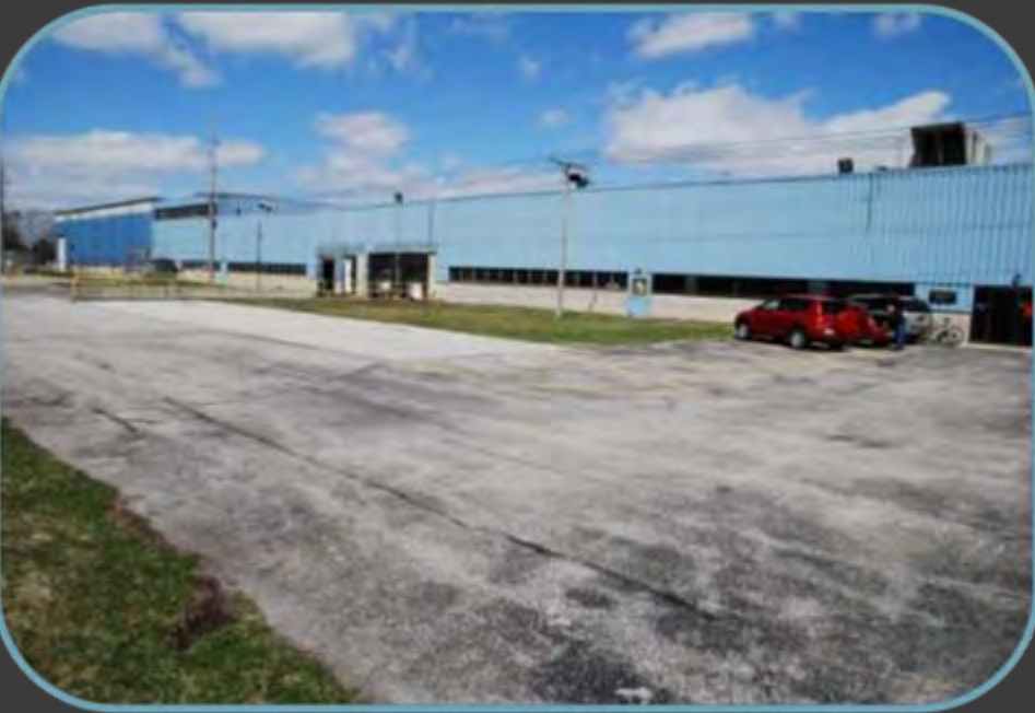
Rolling Mill Plant